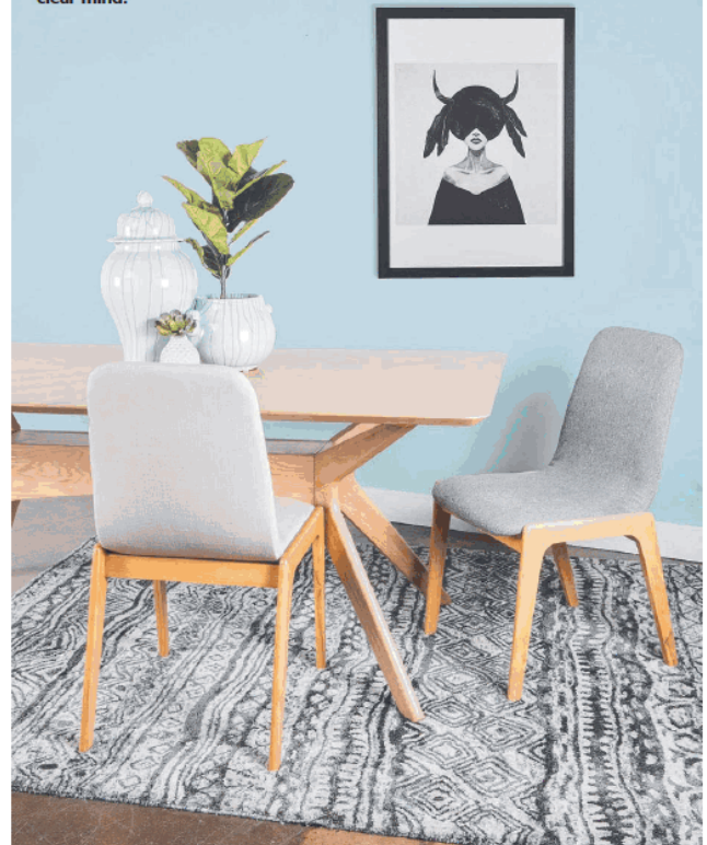
Lee Allcock from Matt Blatt says a clear space is a clear mind.

"Many people just want a comforting, simple space to unwind. Keeping it minimal is a great way to make sure"