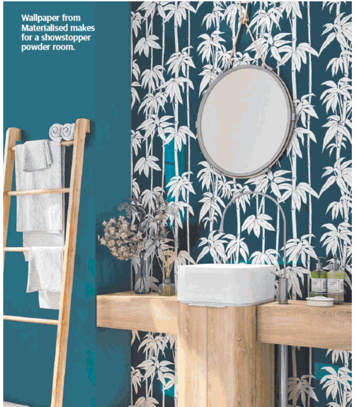
Wallpaper from Materialised makes for a showstopper powder room.

"Elevate your powder room to a guest-worthy space by accessorising with small touches," says Daniela from Reece. "In a powder room, there are decisions you can make in the design process to increase the illusion of space. For example, wall-hung vanity units provide storage and toilet pans with concealed cisterns give the illusion of extra floor space. Because powder rooms are high-traffic areas, Daniela says it makes sense to choose high-quality products that will last the test of time. More: reece.com.au Picture: Interior design by decus.com.au ; fittings by candana.com.au